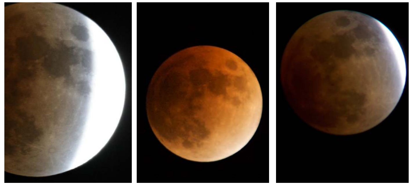
Taken at 9:40 EST, from Brampton, Ont. Canon XTi @ ISO 800, 0.6 sec, 2000 mm F/10 Celestron scope.