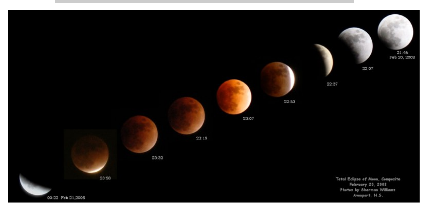
Eclipse sequence: photographed and created by Sherman Williams Sony "Cybershot" 8.1 mega pixel camera, tripod mount, manual setting. Photos taken at St Croix.